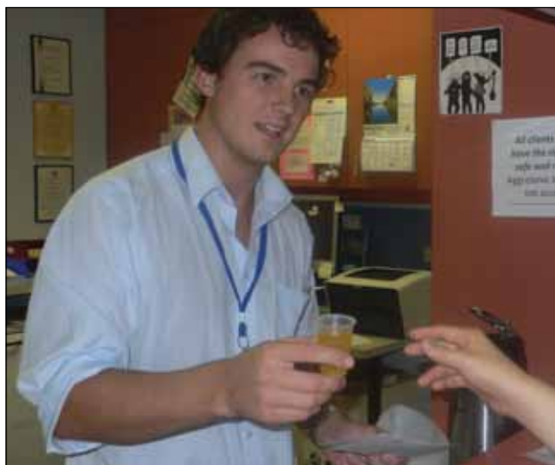
Figure 1. Opioid pharmacotherapies are usually dispensed in a supervised setting, with dosing observed by the dispensing pharmacist

active role in care through supervision of medication and feedback of progress to the prescriber. As with other patients with complex medical problems, difficult patients with opioid addiction may be referred to specialist physicians.